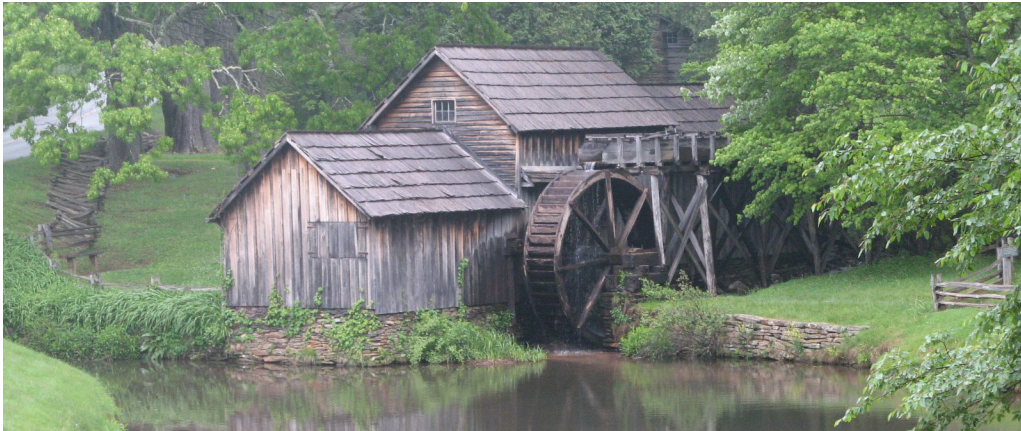
Creek water is diverted through a series of shutes to power the Mabry Grist Mill in the Blue Ridge mountains of Virginia. ( https://otrwm.wordpress.com/tag/historic-mabry-grist-mill/ )

Show Location: Agricultural Heritage Museum Grounds, 29550 Palmyra Rd., Warrenton, MO